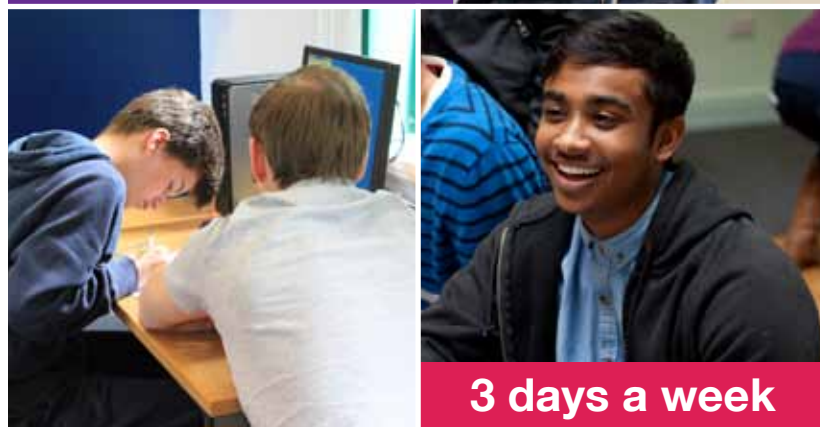
3 days a week