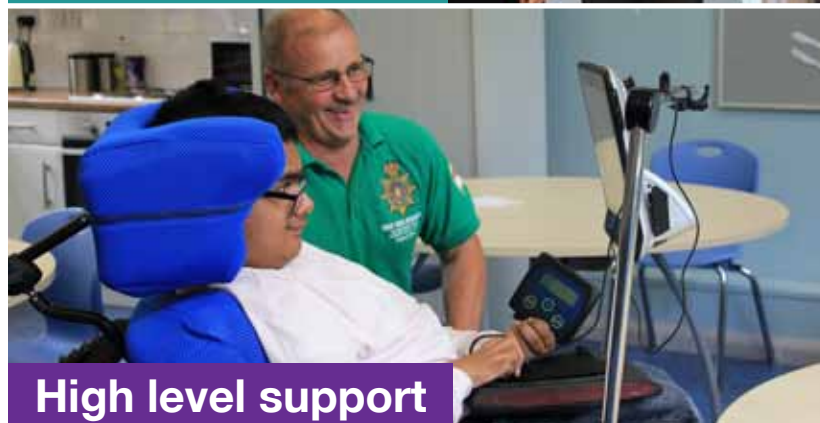
High level support